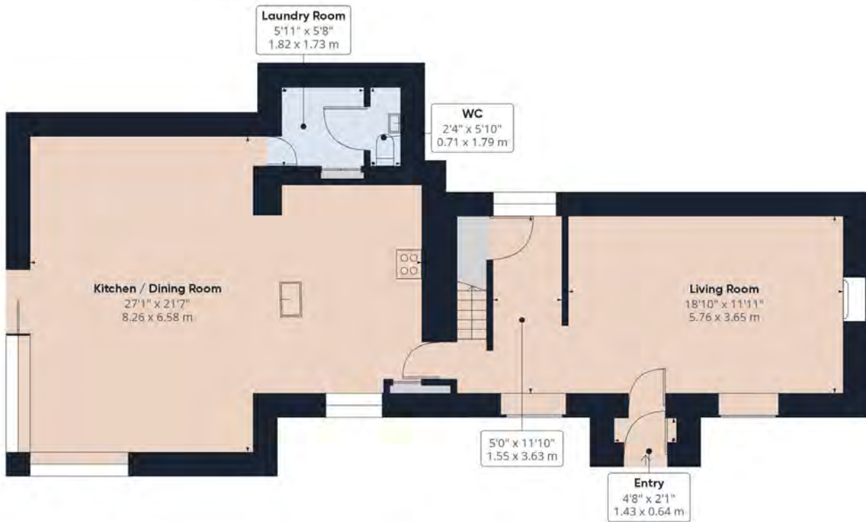
Floor 0 Building 1