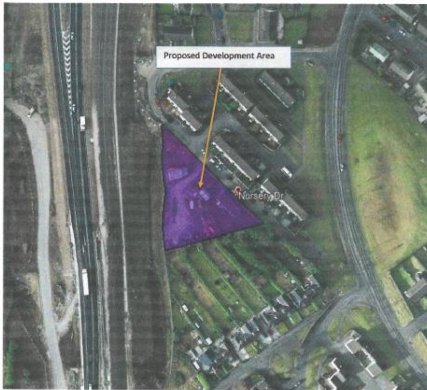
Figure 3 Google Maps Image of Site

A desk top review of satellite imagery shows that the existing development site is brownfield and may provide a storm water offsetting solution, refer to Figure 3 .