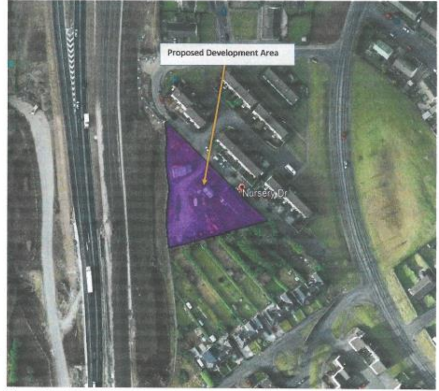
Figure 3 Google Maps Image of Site

A desk top review of satellite imagery shows that the existing development site is brownfield and may provide a storm water offsetting solution, refer to Figure 3.