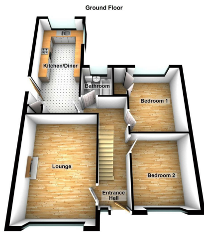
Images for illustrative purposes only and subject to change. Plan produced using Planigo.