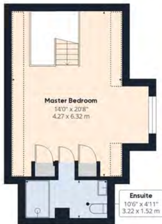
Floor 2 Building 1