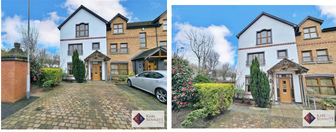
Hardwood front door