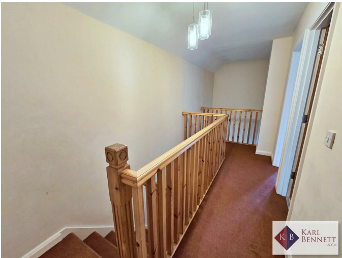
Access to roof space.