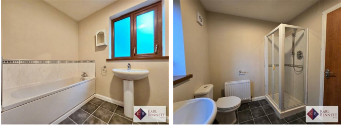
Four piece white suite comprising low flush WC, pedestal wash hand basin with chrome mixer tap. Panel bat with chrome mixer tap. Single shower unit with thermostatically controlled shower. Tiled floor, part tiled walls. Extractor fan.