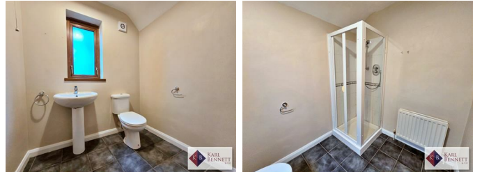
Three piece white suite comprising low flush WC, pedestal wash hand basin with chrome mixer tap. Single shower unit with thermostatically controlled shower. Tiled floor and part tiled walls. Extractor fan.