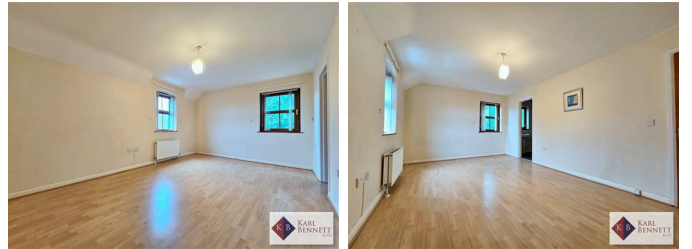
Laminate wood floor.