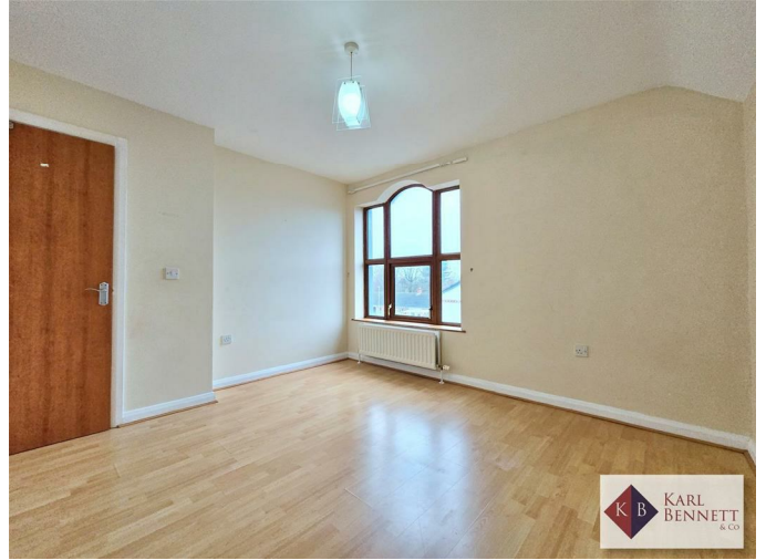
At widest points. Laminate wood floor.