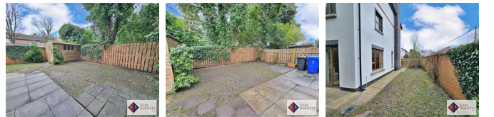
Enclosed rear garden and side garden laid in lawn and outside water tap.