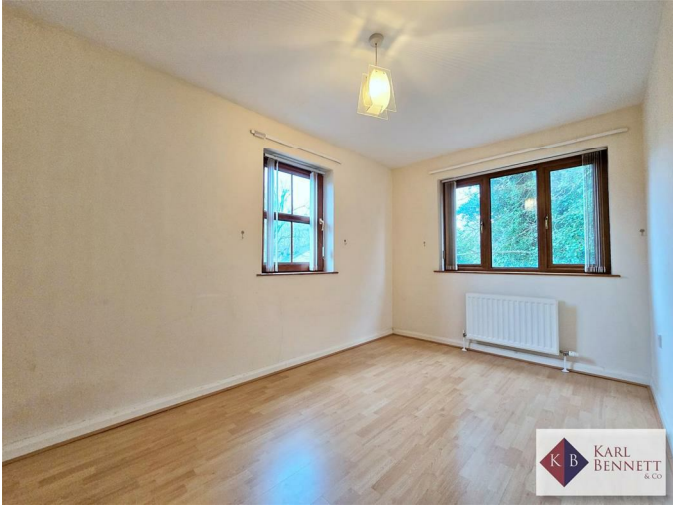
Laminate wood floor.