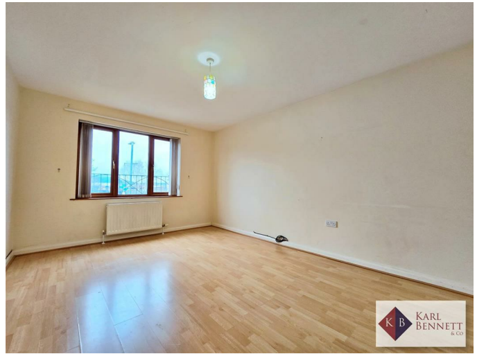
Bedroom 3 14'11" x 10'11"

Low flush WC, pedestal wash hand basin with chrome mixer tap. Tiled floor. Extractor fan.