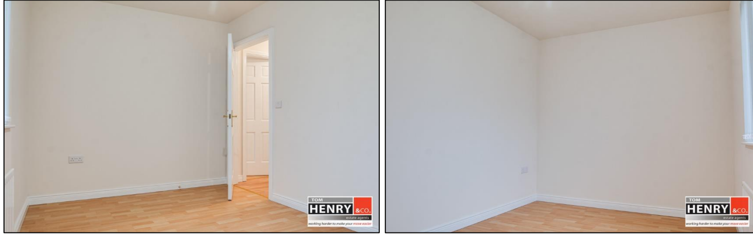
BEDROOM 3: TO REAR: PRE-FINISHED FLOOR.