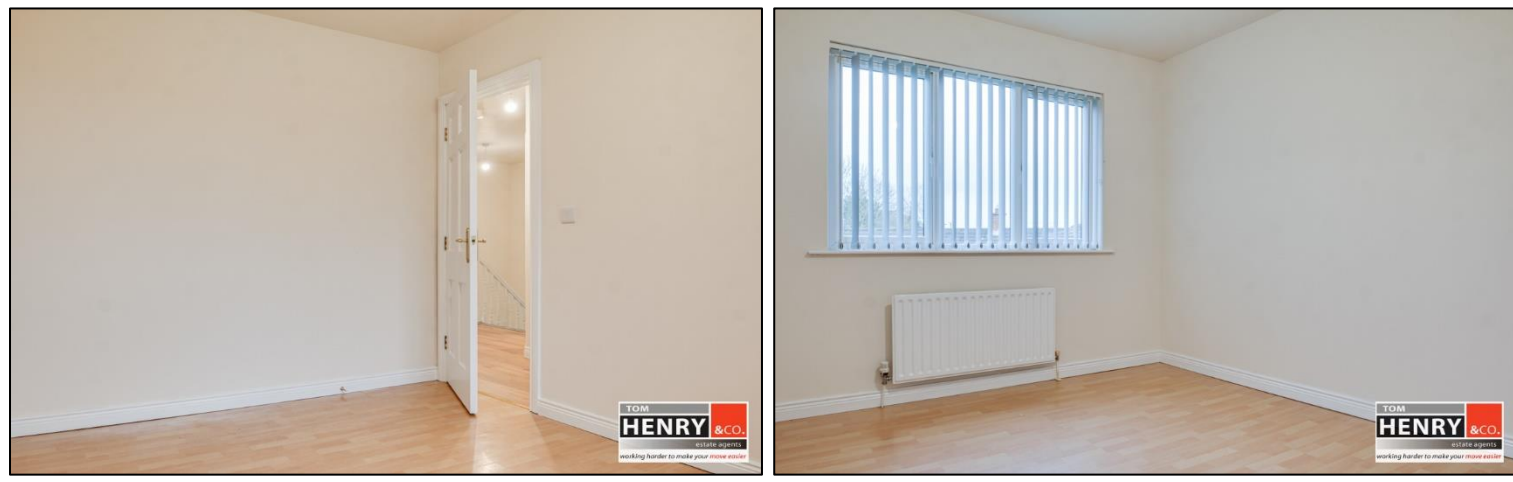
BEDROOM 4: TO REAR. PRE-FINISHED FLOOR.