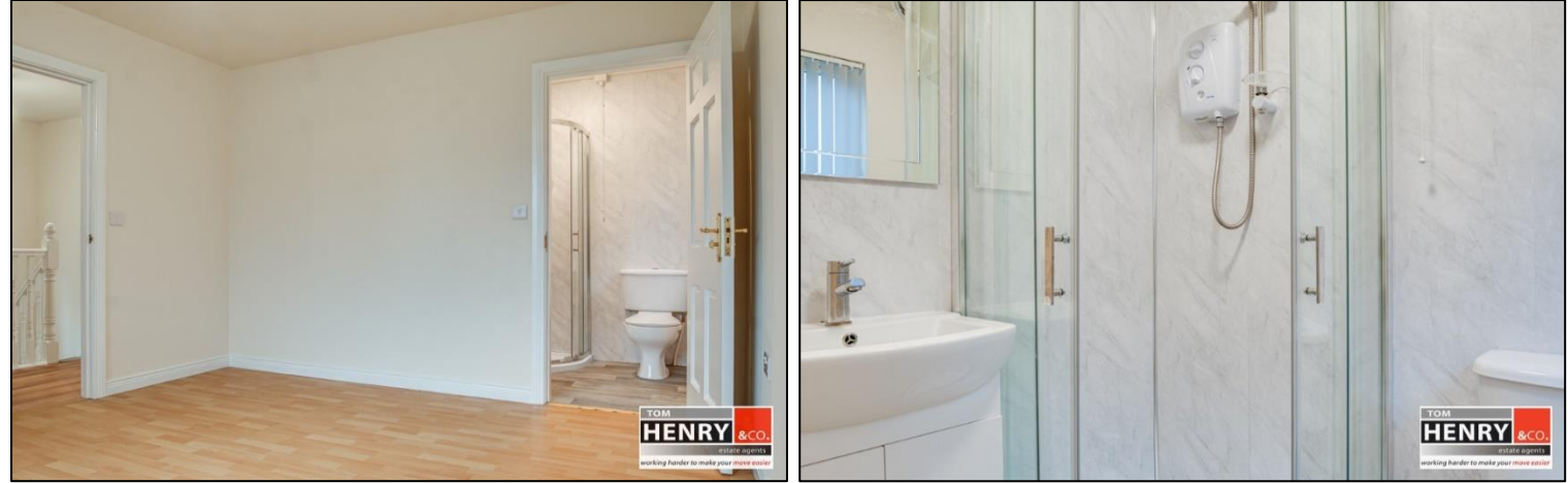
BEDROOM 2: TO FRONT. PRE-FINISHED FLOOR.

ENSUITE: WHITE SUITE. ELECTRIC SHOWER. TOILET. WASH HAND BASIN IN VANITY UNIT. PART PANELLED, PART TILED WALLS. PRE-FINISHED FLOOR. X-FAN.