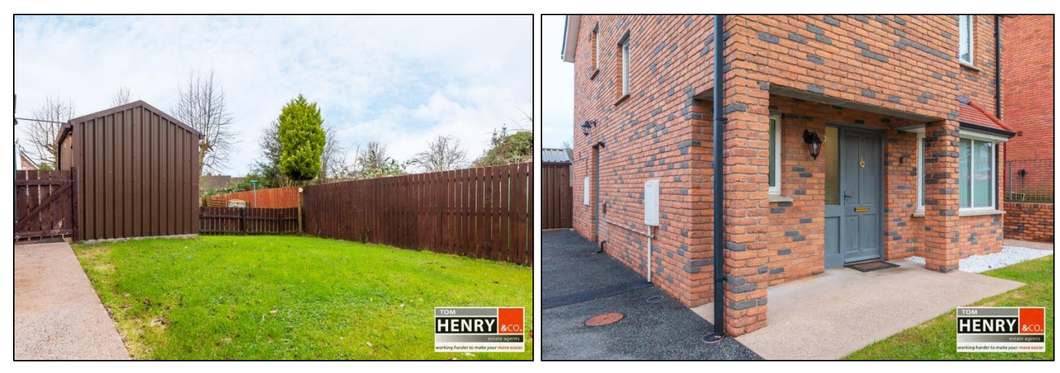
ACCOMMODATION IN BRIEF...