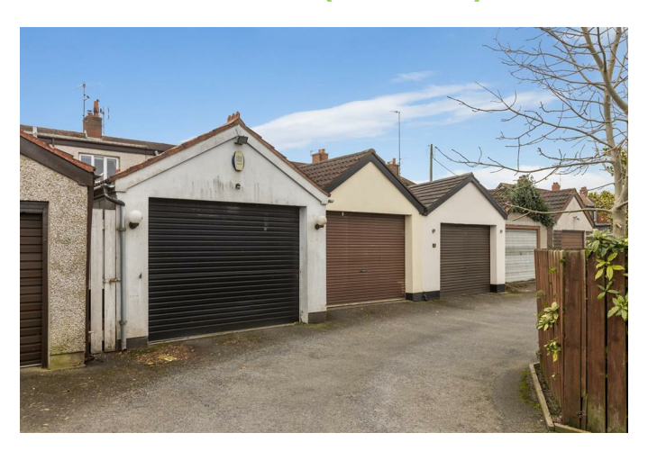
Wired with Electric / remote controlled roller door.