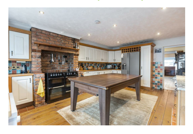
Excellent range of high and low level units.

Belfast sink with mixer tap, space for range cooker within large exposed brick alcove, plumbed for washing machine, part wooden / tiled floor. Access to garage.