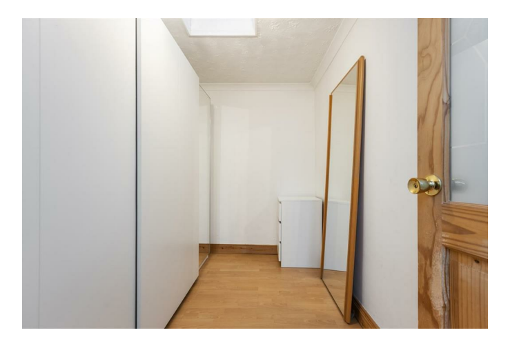
Feature corniced ceiling. Skylight and laminate floor