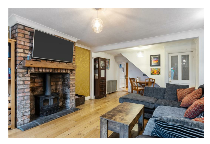
Multi fuel burning stove with exposed brick surround and wooden floor.

LIVING / DINING ROOM 25'11" x 12'7" (7.9 x 3.86)