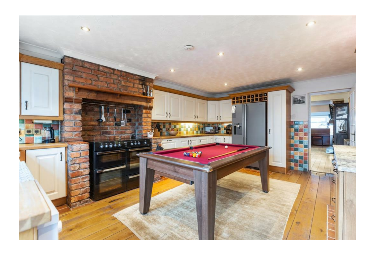
ON THE FIRST FLOOR

Belfast sink with mixer tap, space for range cooker within large exposed brick alcove, plumbed for washing machine, part wooden / tiled floor. Access to garage.