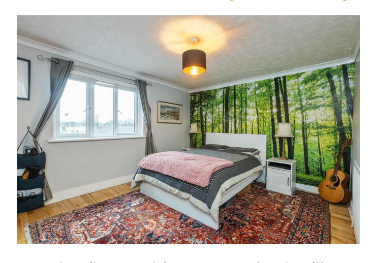
Wooden floor and feature corniced ceiling.

BEDROOM ONE 13'2 x 10'10 (4.01m x 3.30m)