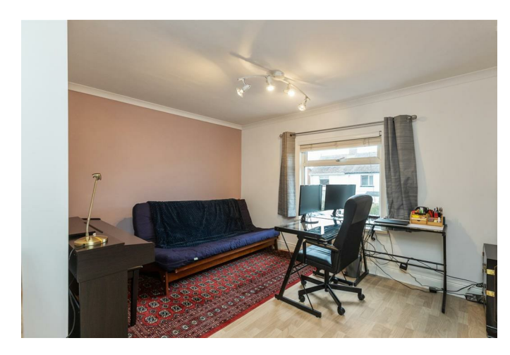
Feature corniced ceiling.

BEDROOM TWO 12'11" x 11'10" (3.96 x 3.61)