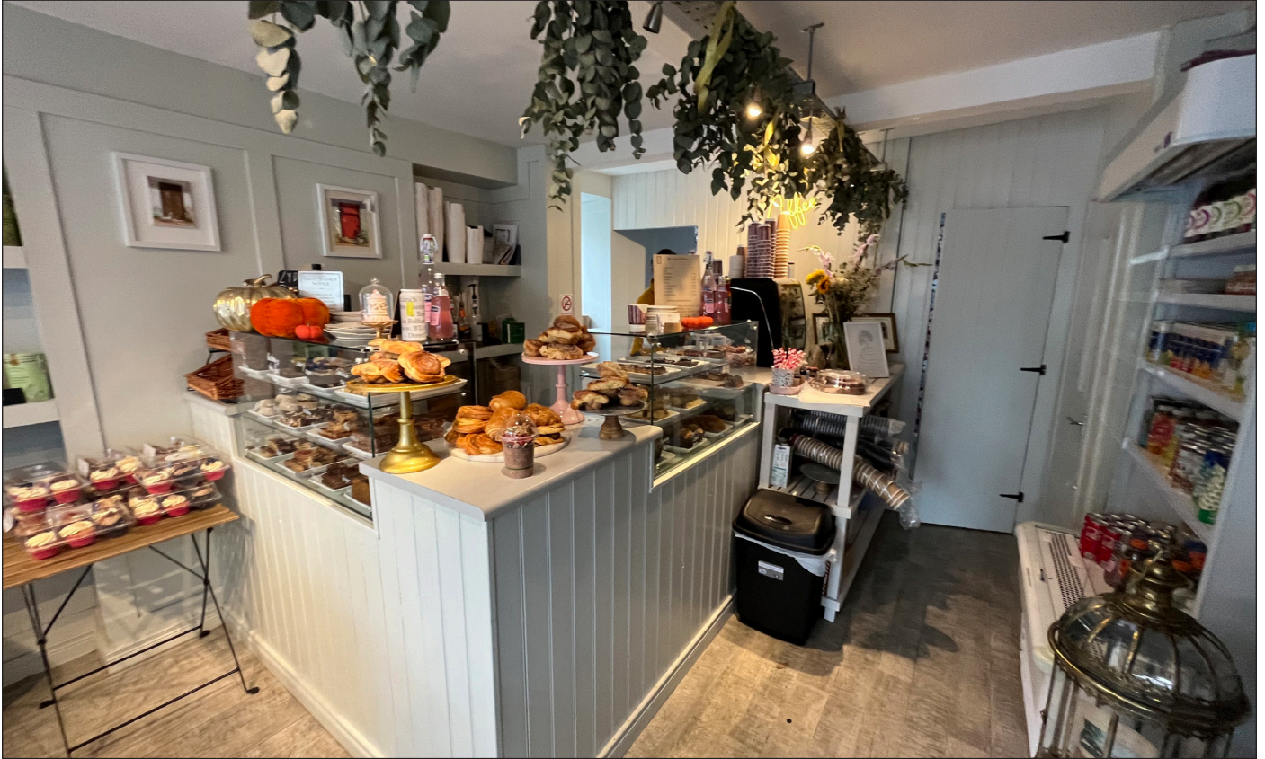
Lydia's (vacated July 2024)