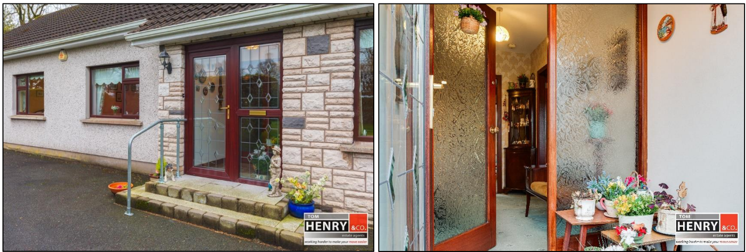
ENTRANCE PORCH / VESTIBULE: P.V.C. EXTERNAL DOOR WITH LEADED GLAZED PANEL & LEADED GLAZED SIDE PANELS. TILED FLOOR.