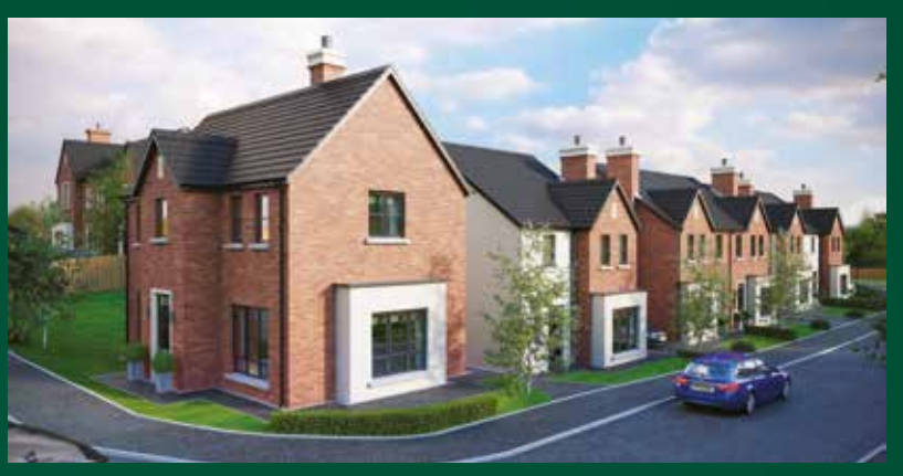
BROOKE HALL WOOD, BELFA

Copyright notice: All rights reserved. The contents of this brochure may not be reproduced, copied, redistributed, or otherwise made available in whole or part without the prior written consent from the developer.