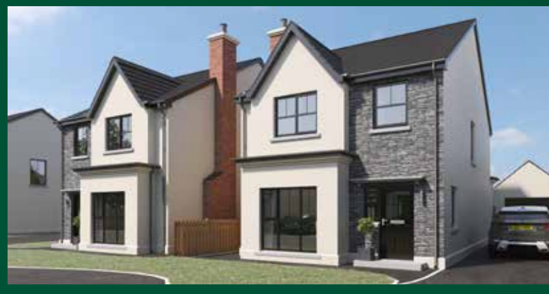
RELVOIR VIEW MEWS RELEAT

At PWD we take great pride in providing homes of exceptional quality in the most sought after residential locations.