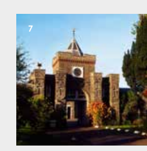
The National Trust, Patterson's Spade Mill, Templepatrick