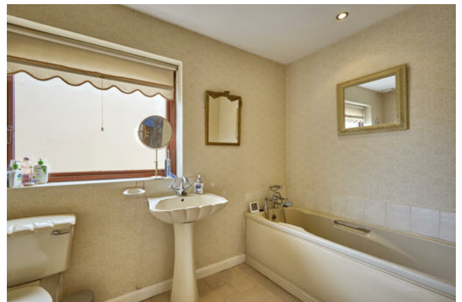
BATHROOM: Coloured bathroom suite comprising panelled bath with mixer tap and telephone hand shower, pedestal wash hand basin, low flush wc, walk-in storage cupboard with thermostatic shower unit, LED lighting.