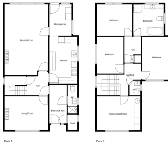
Sizes And Dimensions Are Approximate. Actual May Vary.

From Castlereagh Road junction continue along the Upper Knockbreda Road (dual carriageway) and after approximately a quarter of a mile at traffic lights turn left into Casaedona Park and then take next left into Casaedona Rise.