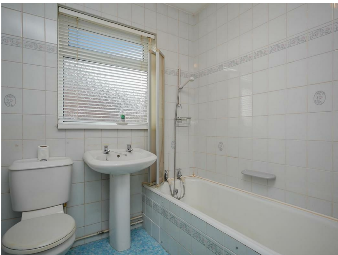
White bathroom suite comprising tiled bath panel, pedestal wash hand basin, low flush w.c