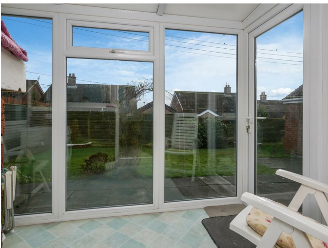
Access to patio garden.