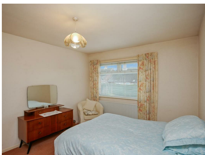
Bedroom Two / Dining Room 11'11 x 11'8 (3.63m x 3.56m)