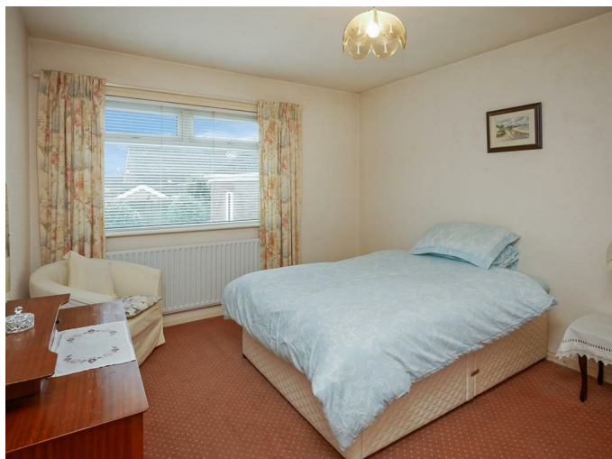
Bedroom One 14'0 x 10'9 (4.27m x 3.28m)