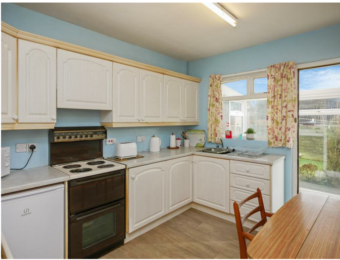
Full range of high and low level units, single drainer sink unit with mixer taps. Plumbed for washing machine. Direct access to lean to pvc conservatory.