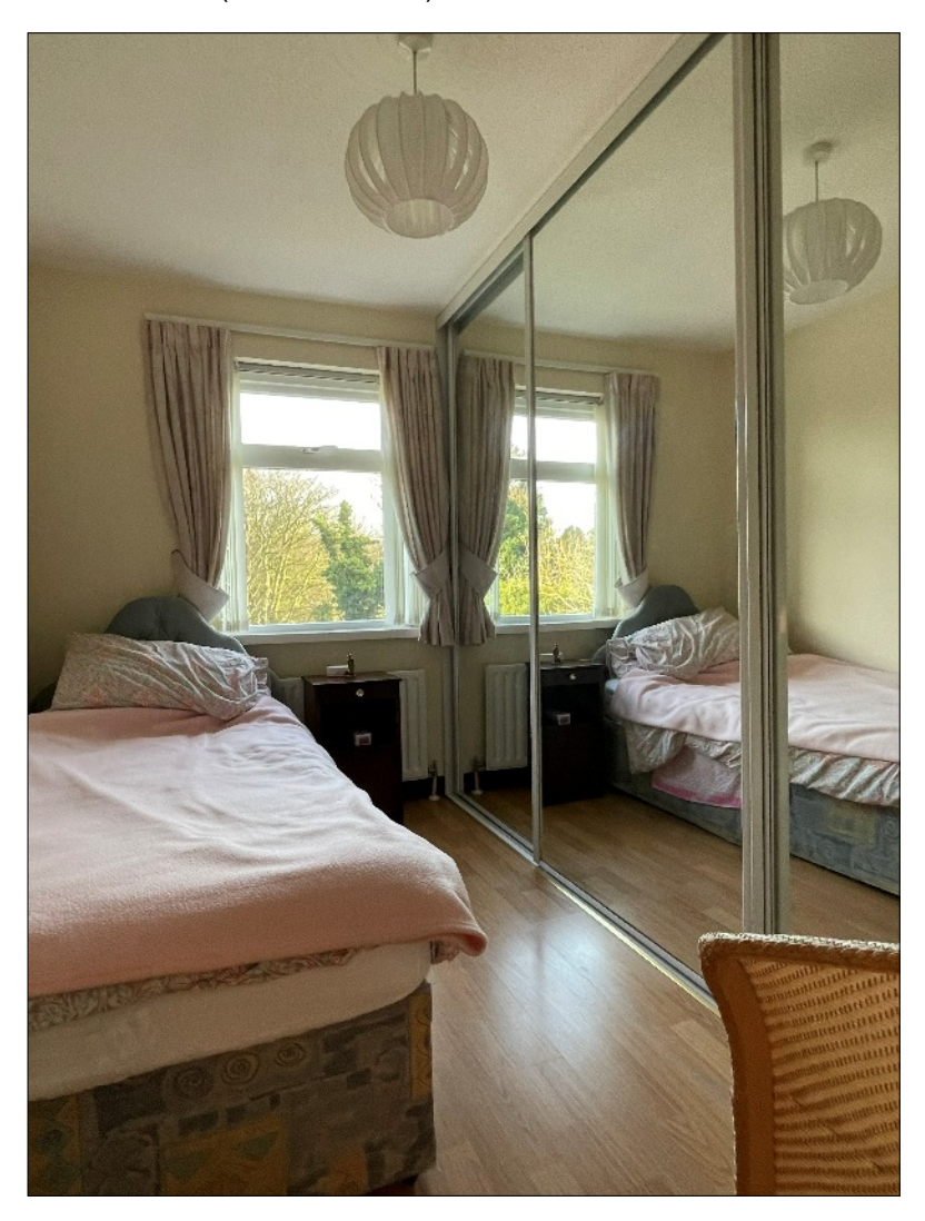
BEDROOM 3: 16' 9" x 11' 5" (5.10m x 3.49m) With wood effect flooring.