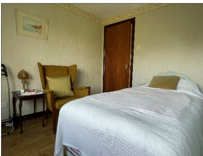
BEDROOM 2: 10' 8" x 10' 5" (3.25m x 3.17m)