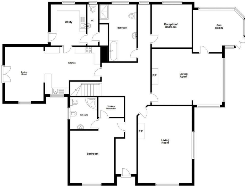
Ground Floor Approx. 183.4 sq. metres (1974.0 sq. feet)