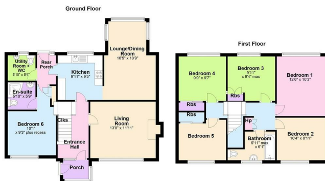
3 Movilla Road, Downpatrick

Terms & Conditions: Please note that these particulars do not constitute an offer or contract of sale. Any prospective purchaser should satisfy themselves by thorough inspection of the property and we recommend that any prospective purchaser should employ the professional services of a building surveyor and consider their findings prior to entering into contract. All such fees associated with this work will be the responsibility of the prospective purchaser regardless of whether the sale completes or not. In addition, none of the appliances or installations have been tested in any way whatsoever and it is our recommendation that a purchaser should fully satisfy themselves by employing an appropriate expert. We would also like to advise that our measurements are taken from the widest points of each room and should not be relied upon as completely accurate. You should not make decisions based on the measurements provided and double check measurements at all times. Valuation/Mortgage Service: As part of our service we would remind Vendors and potential purchasers that we have a Mortgage Broker available at this branch. If you are thinking of selling, we would be happy to carry out a free market appraisal of your property.