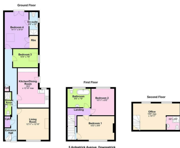
5 Ardpatrick Avenue, Downpatrick

Terms & Conditions: Please note that these particulars do not constitute an offer or contract of sale. Any prospective purchaser should satisfy themselves by thorough inspection of the property and we recommend that any prospective purchaser should employ the professional services of a building surveyor and consider their findings prior to entering into contract. All such fees associated with this work will be the responsibility of the prospective purchaser regardless of whether the sale completes or not. In addition, none of the appliances or installations have been tested in any way whatsoever and it is our recommendation that a purchaser should fully satisfy themselves by employing an appropriate expert. We would also like to advise that our measurements are taken from the widest points of each room and should not be relied upon as completely accurate. You should not make decisions based on the measurements provided and double check measurements at all times. Valuation/Mortgage Service: As part of our service we would remind Vendors and potential purchasers that we have a Mortgage Broker available at this branch. If you are thinking of selling, we would be happy to carry out a free market appraisal of your property.