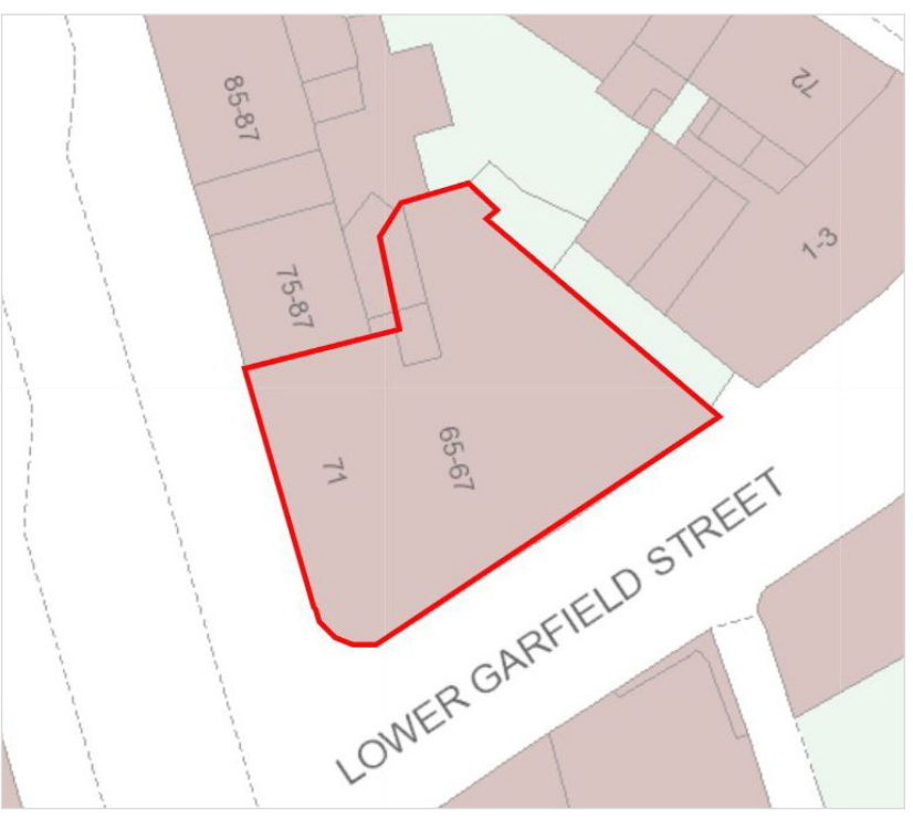
For identification purposes only