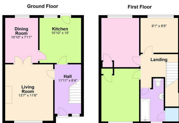
7 Knowes Crescent

Terms & Conditions: Please note that these particulars do not constitute an offer or contract of sale. Any prospective purchaser should satisfy themselves by thorough inspection of the property and we recommend that any prospective purchaser should employ the professional services of a building surveyor and consider their findings prior to entering into contract. All such fees associated with this work will be the responsibility of the prospective purchaser regardless of whether the sale completes or not. In addition, none of the appliances or installations have been tested in any way whatsoever and it is our recommendation that a purchaser should fully satisfy themselves by employing an appropriate expert. We would also like to advise that our measurements are taken from the widest points of each room and should not be relied upon as completely accurate. You should not make decisions based on the measurements provided and double check measurements at all times. Valuation/Mortgage Service: As part of our service we would remind Vendors and potential purchasers that we have a Mortgage Broker available at this branch. If you are thinking of selling, we would be happy to carry out a free market appraisal of your property.