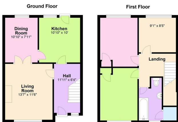
7 Knowes Crescent

Terms & Conditions: Please note that these particulars do not constitute an offer or contract of sale. Any prospective purchaser should satisfy themselves by thorough inspection of the property and we recommend that any prospective purchaser should employ the professional services of a building surveyor and consider their findings prior to entering into contract. All such fees associated with this work will be the responsibility of the prospective purchaser regardless of whether the sale completes or not. In addition, none of the appliances or installations have been tested in any way whatsoever and it is our recommendation that a purchaser should fully satisfy themselves by employing an appropriate expert. We would also like to advise that our measurements are taken from the widest points of each room and should not be relied upon as completely accurate. You should not make decisions based on the measurements provided and double check measurements at all times. Valuation/Mortgage Service: As part of our service we would remind Vendors and potential purchasers that we have a Mortgage Broker available at this branch. If you are thinking of selling, we would be happy to carry out a free market appraisal of your property.