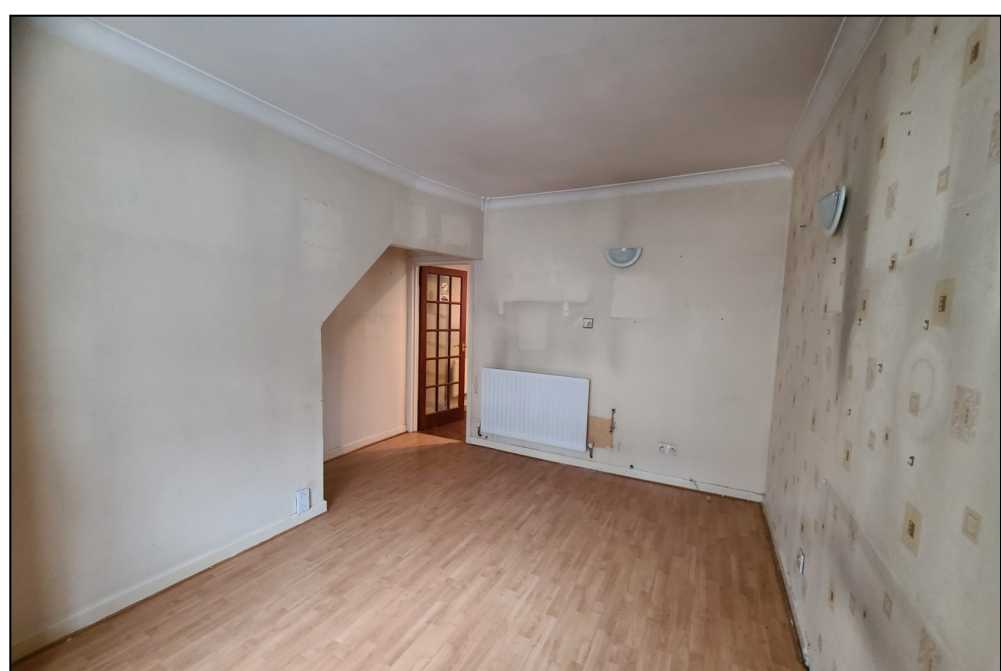
FOR SALE - 13 James Street, Coleraine