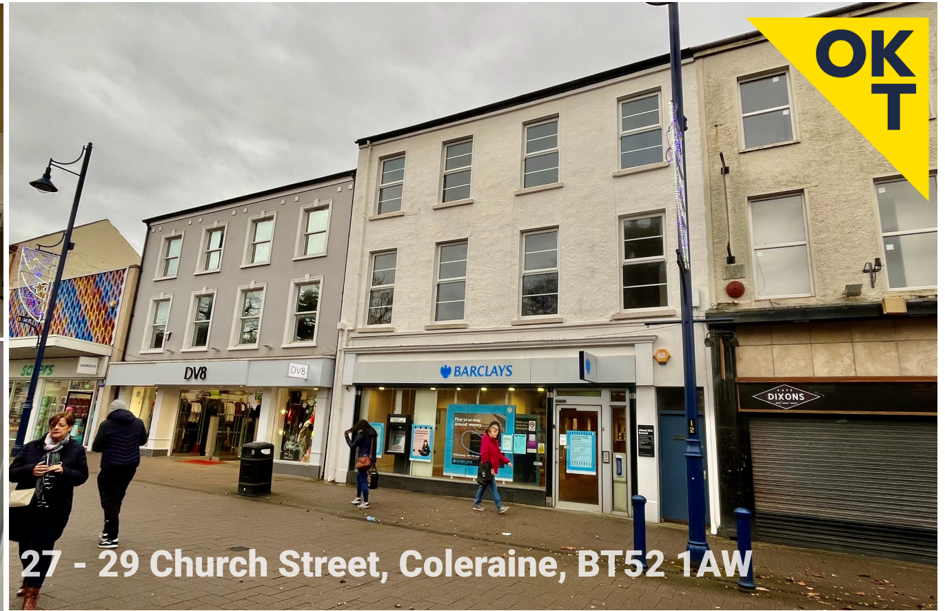
27 - 29 Church Street, Coleraine, BT52 1AW