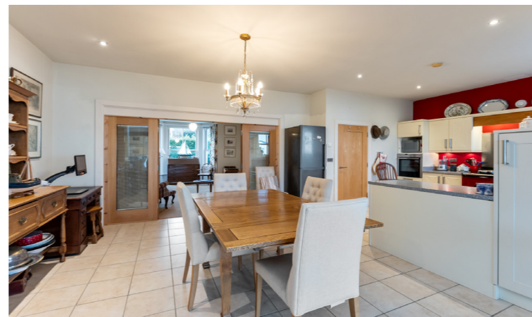
Kitchen open to dining area