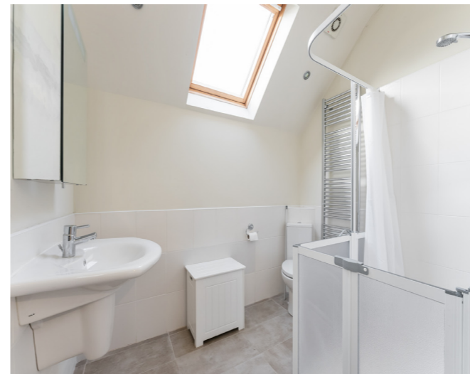
Shower room with easy access shower