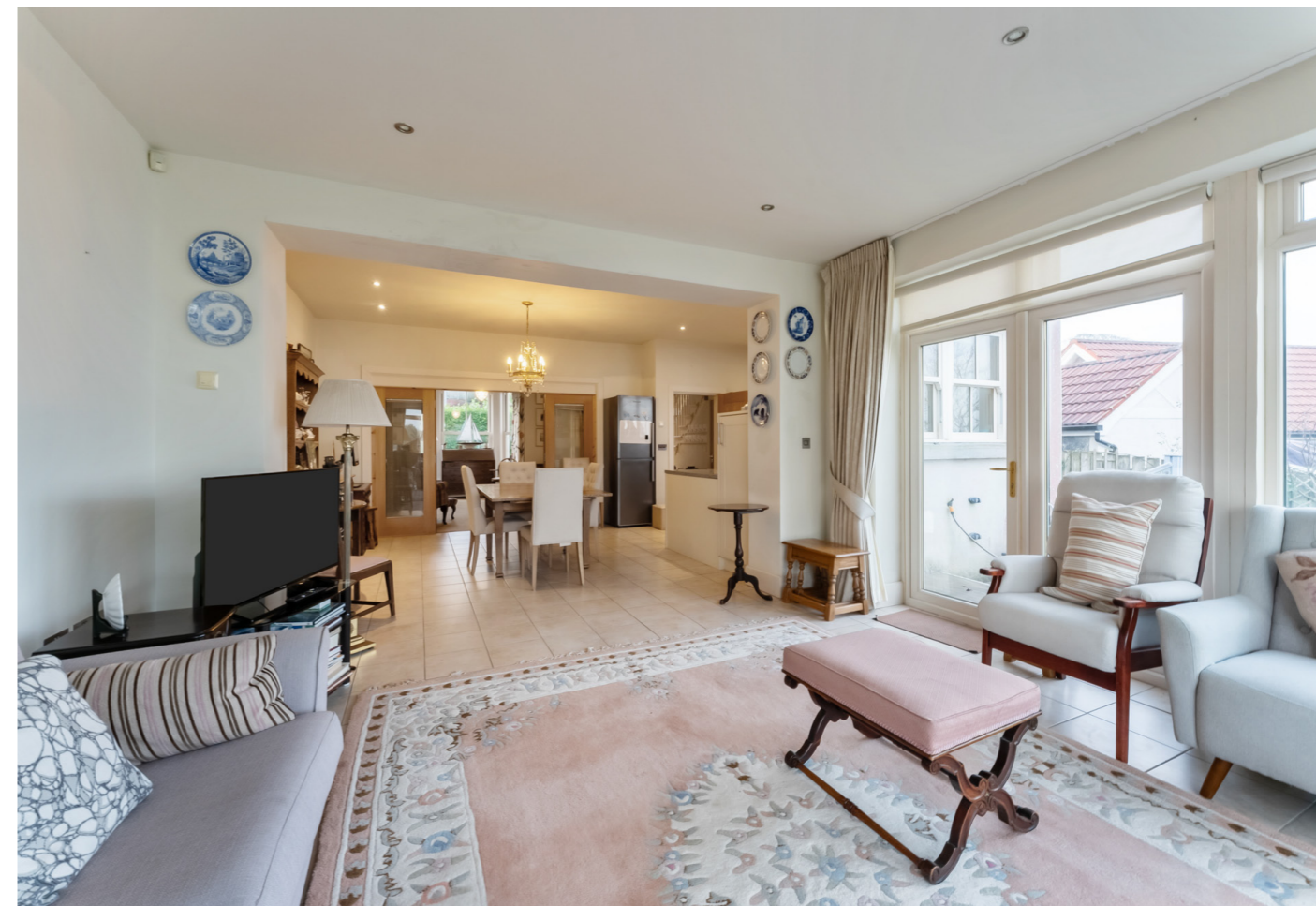
Sunroom open to dining/kitchen