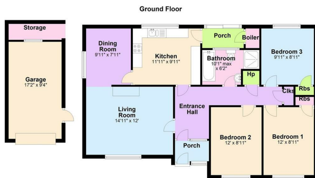
20 Carlisle Park, Ballynahinch

Terms & Conditions: Please note that these particulars do not constitute an offer or contract of sale. Any prospective purchaser should satisfy themselves by thorough inspection of the property and we recommend that any prospective purchaser should employ the professional services of a building surveyor and consider their findings prior to entering into contract. All such fees associated with this work will be the responsibility of the prospective purchaser regardless of whether the sale completes or not. In addition, none of the appliances or installations have been tested in any way whatsoever and it is our recommendation that a purchaser should fully satisfy themselves by employing an appropriate expert. We would also like to advise that our measurements are taken from the widest points of each room and should not be relied upon as completely accurate. You should not make decisions based on the measurements provided and double check measurements at all times. Valuation/Mortgage Service: As part of our service we would remind Vendors and potential purchasers that we have a Mortgage Broker available at this branch. If you are thinking of selling, we would be happy to carry out a free market appraisal of your property.