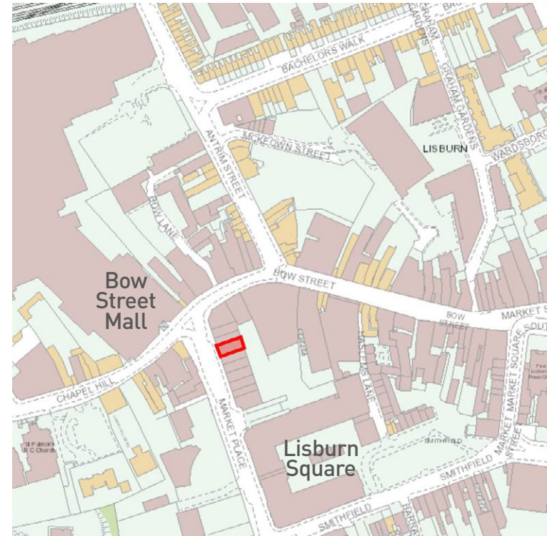
Not To Scale. For indicative purposes only.

McKIBBIN COMMERCIAL PROPERTY CONSULTANTS for themselves and the vendors or lessors of this property whose agents they are given notice that: 1) The particulars are produced in good faith, are set out as a general guide only and do not constitute any part of the contract; 2) No person in the employment of McKIBBIN COMMERCIAL PROPERTY CONSULTANTS has any authority to make or give any representation or warranty whatever in relation to this property. As a business carrying out estate agency work when we enter into a relationship with a customer, we are required, if applicable, to verify the identity of both vendor and purchaser as outlined in the Money Laundering, Terrorist Financing and Transfer of Funds (Information on the Payer) Regulations 2017 - http://www.legislation.gov.uk/ukSI/2017/692/made . In accordance with legislation, any information and documentation provided by you will be held for a period of five years from when you cease to have a contractual relationship with McKibbin Commercial. The information will be held in accordance with the General Data Protection Regulations (GDPR) and will not be passed on to any other party unless we are required to do so by law.