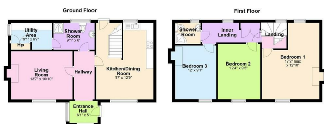
24 Church Street, Downpatrick

Terms & Conditions: Please note that these particulars do not constitute an offer or contract of sale. Any prospective purchaser should satisfy themselves by thorough inspection of the property and we recommend that any prospective purchaser should employ the professional services of a building surveyor and consider their findings prior to entering into contract. All such fees associated with this work will be the responsibility of the prospective purchaser regardless of whether the sale completes or not. In addition, none of the appliances or installations have been tested in any way whatsoever and it is our recommendation that a purchaser should fully satisfy themselves by employing an appropriate expert. We would also like to advise that our measurements are taken from the widest points of each room and should not be relied upon as completely accurate. You should not make decisions based on the measurements provided and double check measurements at all times. Valuation/Mortgage Service: As part of our service we would remind Vendors and potential purchasers that we have a Mortgage Broker available at this branch. If you are thinking of selling, we would be happy to carry out a free market appraisal of your property.