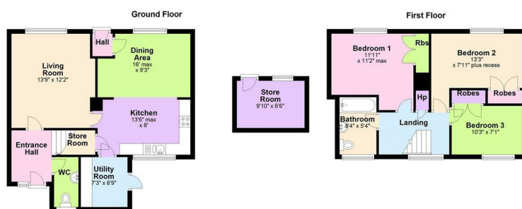
26 Willow Crescent, Ballynahinch

Terms & Conditions: Please note that these particulars do not constitute an offer or contract of sale. Any prospective purchaser should satisfy themselves by thorough inspection of the property and we recommend that any prospective purchaser should employ the professional services of a building surveyor and consider their findings prior to entering into contract. All such fees associated with this work will be the responsibility of the prospective purchaser regardless of whether the sale completes or not. In addition, none of the appliances or installations have been tested in any way whatsoever and it is our recommendation that a purchaser should fully satisfy themselves by employing an appropriate expert. We would also like to advise that our measurements are taken from the widest points of each room and should not be relied upon as completely accurate. You should not make decisions based on the measurements provided and double check measurements at all times. Valuation/Mortgage Service: As part of our service we would remind Vendors and potential purchasers that we have a Mortgage Broker available at this branch. If you are thinking of selling, we would be happy to carry out a free market appraisal of your property.