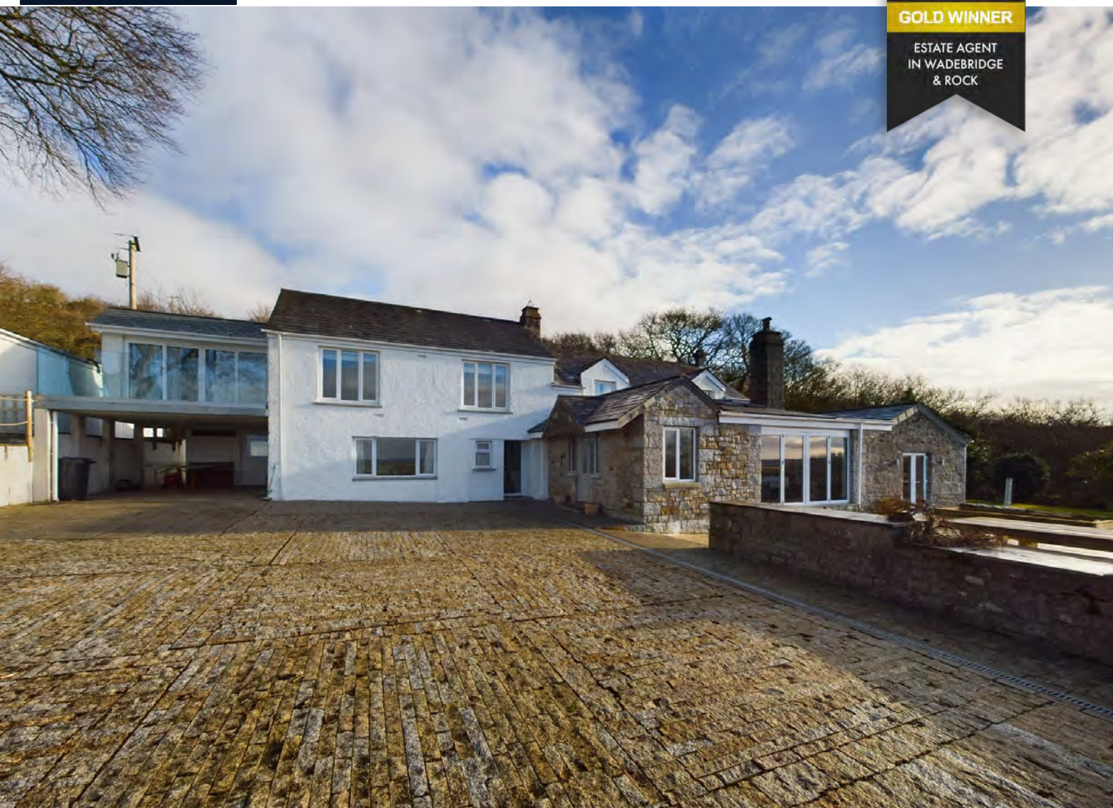
Guide Price - £900,000