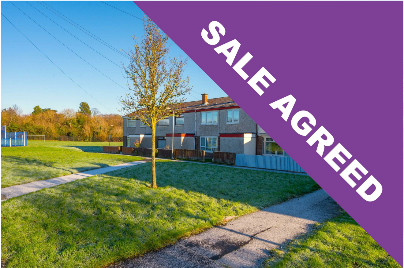
91 Glenville Park, Newtownabbey, BT37 0TE