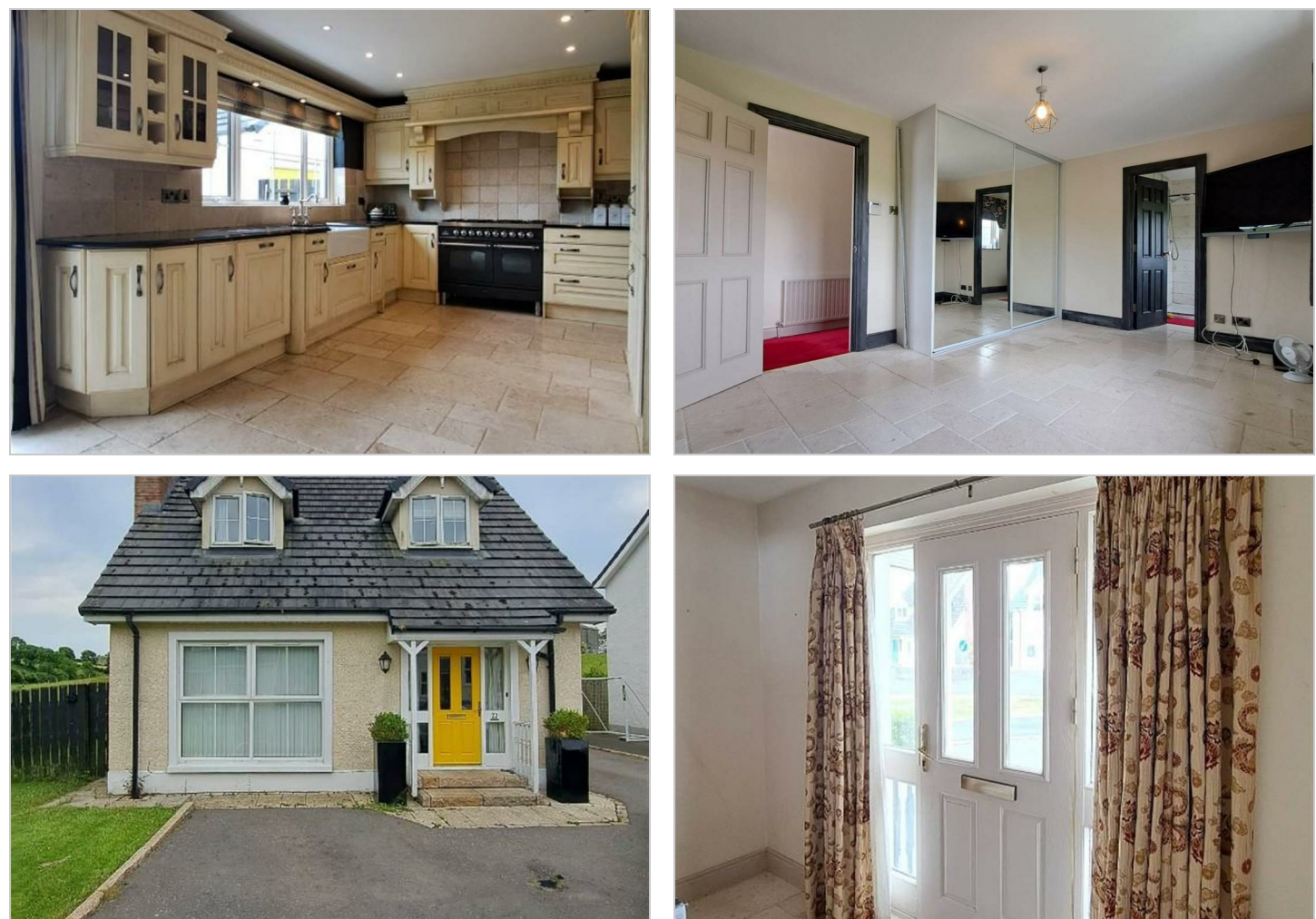
These particulars, whilst believed to be accurate are set out as a general outline only for guidance and do not constitute any part of an offer or contract. Intending purchasers should not rely on them as statements of representation of fact, but must satisfy themselves by inspection or otherwise as to their accuracy. No person in this firms employment has the authority to make or give any representation or warranty in respect of the property.