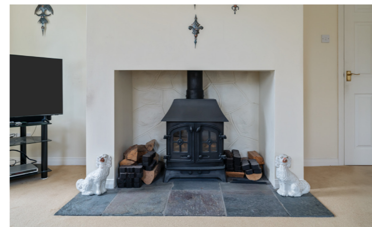
Cast iron stove