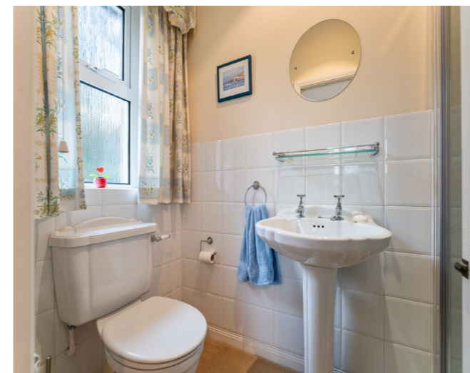
Ensuite shower room