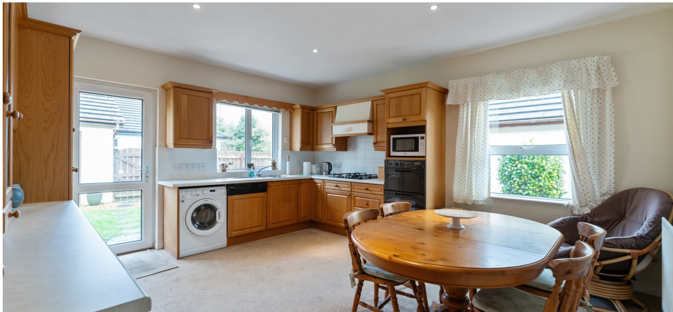
Kitchen with dining area