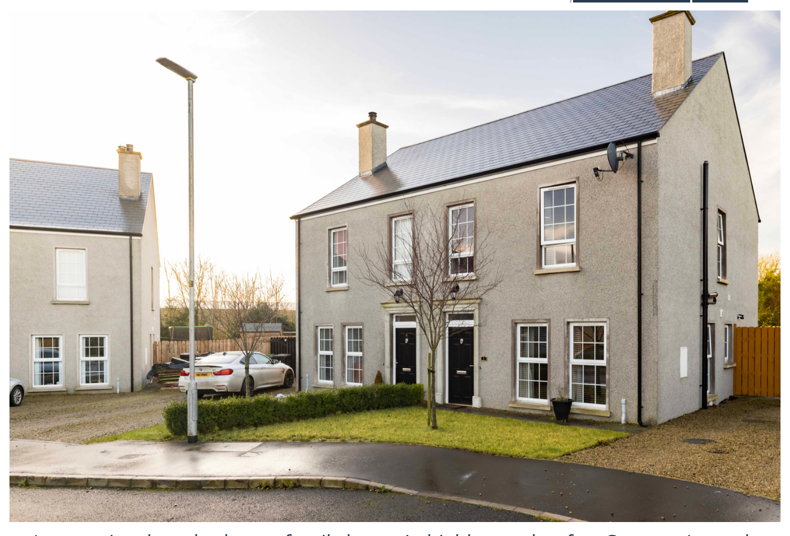
Impressive three bedroom family home in highly sought after Country Armagh countryside location.