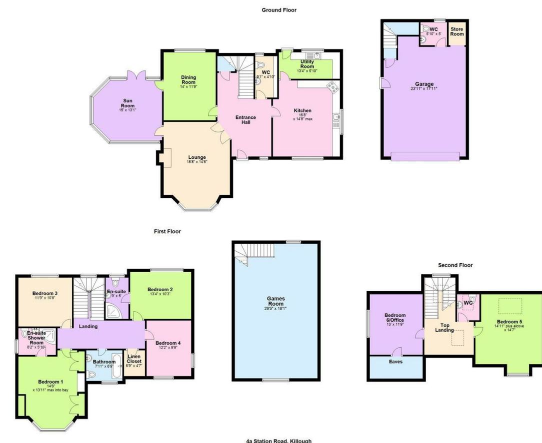
4a Station Road, Killough

Overall this well presented coastal property has everything that you could wish for in a seaside home and is waiting for a new family to create their own special memories.