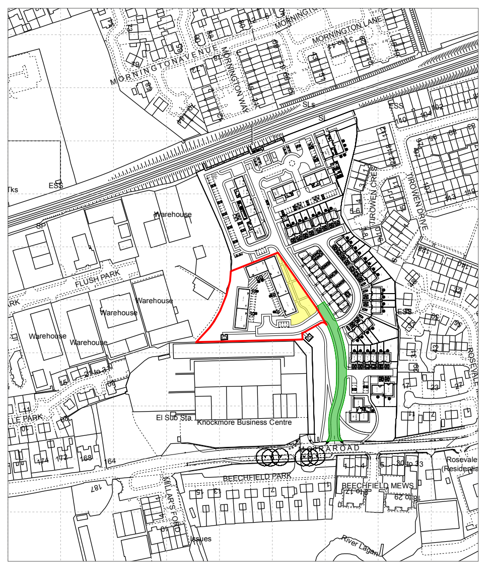
Not To Scale. For indicative purposes only.

All prices are quoted exclusive of VAT, which may be payable.