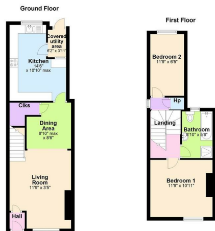
1 Church Lane, Ballynahinch

Terms & Conditions: Please note that these particulars do not constitute an offer or contract of sale. Any prospective purchaser should satisfy themselves by thorough inspection of the property and we recommend that any prospective purchaser should employ the professional services of a building surveyor and consider their findings prior to entering into contract. All such fees associated with this work will be the responsibility of the prospective purchaser regardless of whether the sale completes or not. In addition, none of the appliances or installations have been tested in any way whatsoever and it is our recommendation that a purchaser should fully satisfy themselves by employing an appropriate expert. We would also like to advise that our measurements are taken from the widest points of each room and should not be relied upon as completely accurate. You should not make decisions based on the measurements provided and double check measurements at all times. Valuation/Mortgage Service: As part of our service we would remind Vendors and potential purchasers that we have a Mortgage Broker available at this branch. If you are thinking of selling, we would be happy to carry out a free market appraisal of your property.