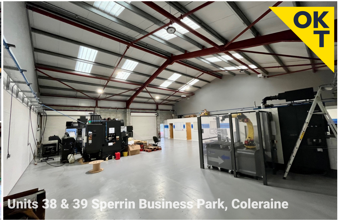
Units 38 & 39 Sperrin Business Park, Coleraine