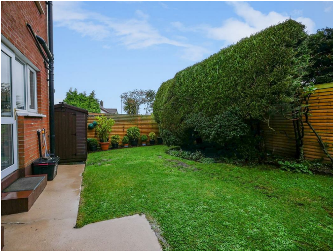
Enclosed rear garden bordered by timber fencing and mature hedges.