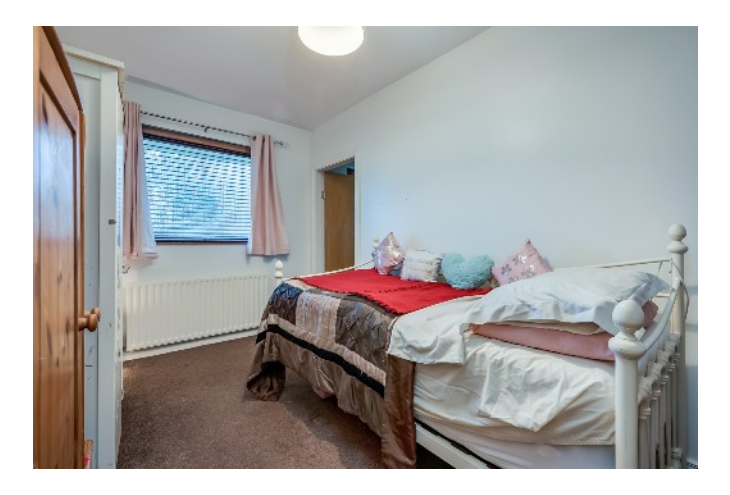
BEDROOM (4): 19' 6" x 14' 1" (5.94m x 4.29m)

BATHROOM: Ceramic tiled floor, floor to ceiling tiling, pedestal wash hand basin, enclosed WC, panel bath, fully tiled shower cubicle, chrome heated towel rail, recessed spot lighting and extractor fan.