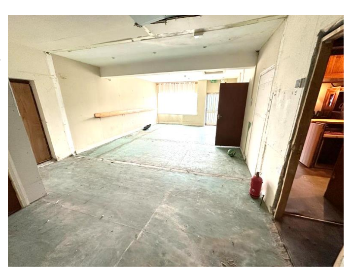
Function Room: 11.90m x 20.19m

Two cubicles, wash hand basin and tiled floor.