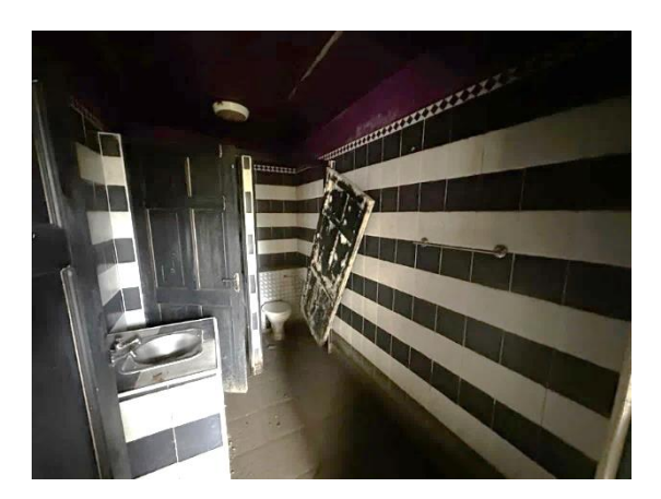
Ladies: 3.50m x 1.86m

Two cubicles, wash hand basin and tiled floor.