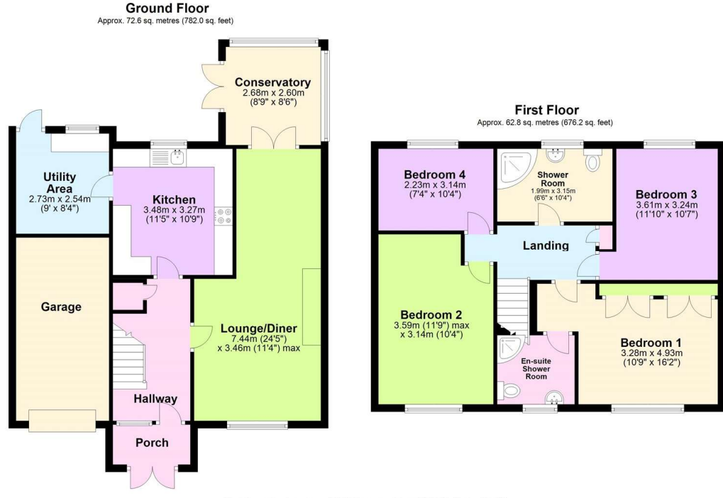
Total area: approx. 135.5 sq. metres (1458.2 sq. feet) BOND OXBOROUGH PHILLIPS Plan produced using PlanUb.