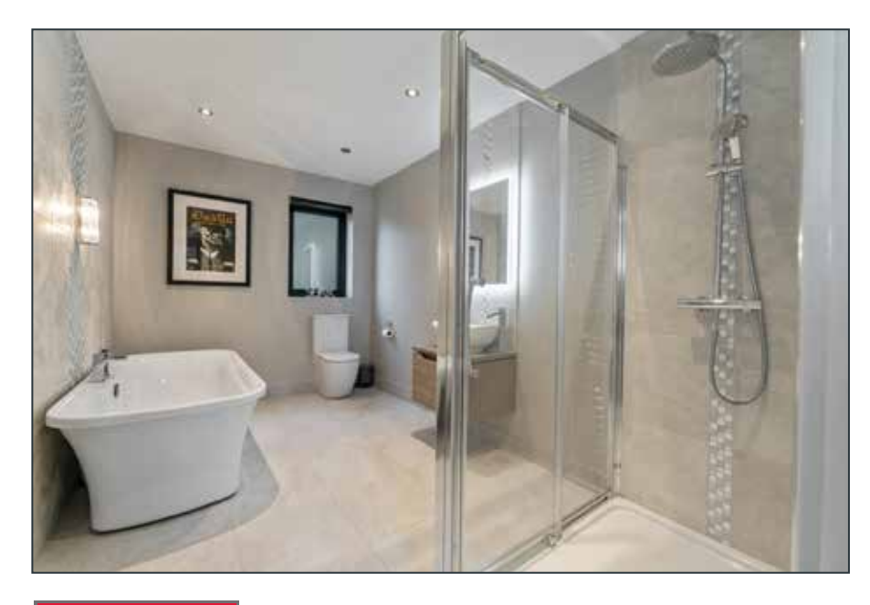
BATHROOM: 13' 1" x 7' 7" (4.00m x 2.30m)

Low flush WC. Pedestal wash hand basin with vanity unit. 'Adamsez' freestanding bath. Double walk-in shower. Ceramic tiled floor. Part tiled walls.