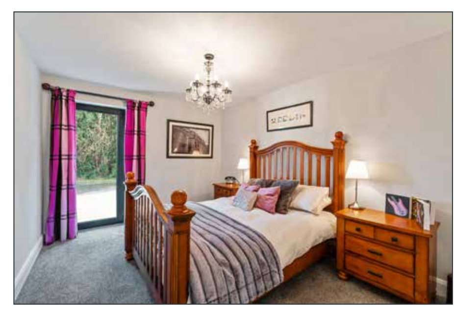
BEDROOM (2): 13' 1" x 10' 2" (4.00m x 3.09m) uPVC door leading outside.