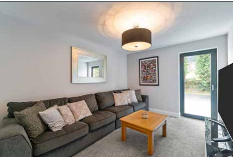
BEDROOM (3): 13' 1" x 10' 2" (4.00m x 3.09m) uPVC door leading outside.