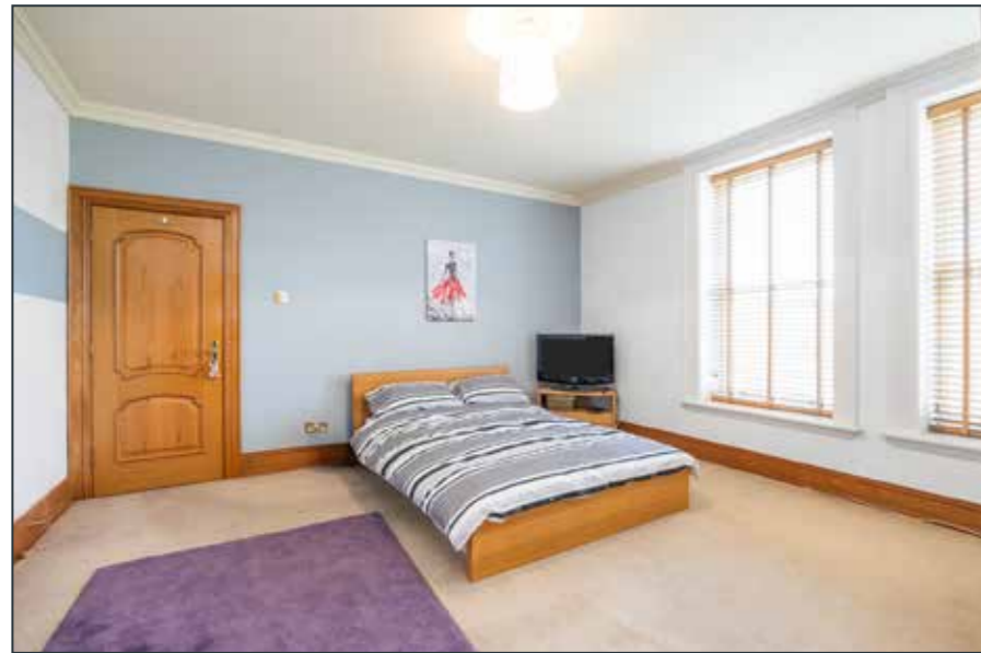
BEDROOM (1): 15' 03" x 14' 03" (4.65m x 4.34m)