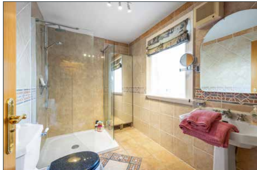
ENSUITE SHOWER ROOM: Fully tiled corner shower cubicle, low flush WC. Pedestal wash hand basin. Heated towel rail. Fully tiled walls and extractor fan.