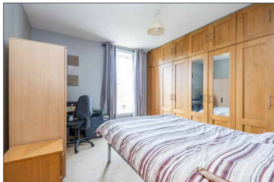
BEDROOM (2): 12' 06" x 10' 08" (3.81m x 3.25m)