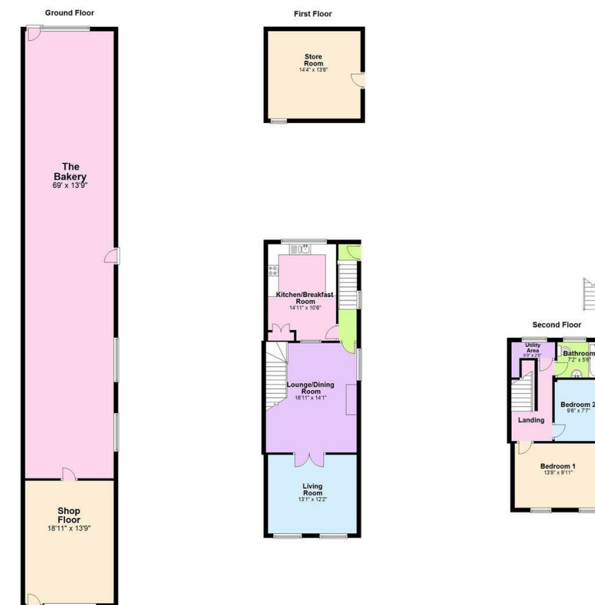
28+28A Main Street, Ballynahinch