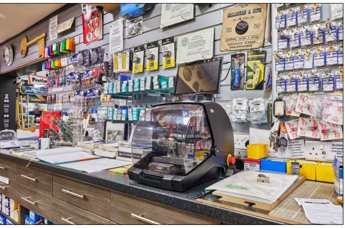
Area 2: 45'11 x 15'6 (Average) Sales area comprising additional counter, shelving, storage, two Velux sky light windows.