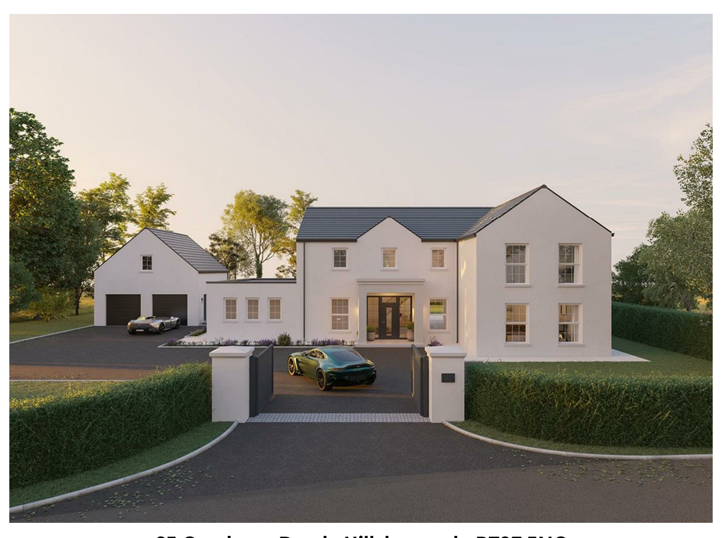
63 Carnbane Road,, Hillsborough, BT27 5NG