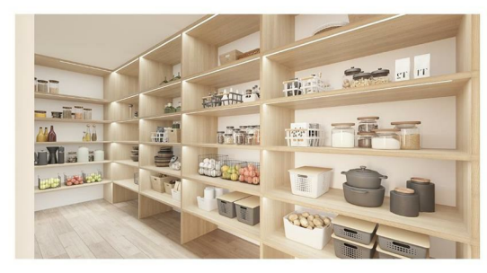
HIDDEN PANTR Motion Sensored Lightin Custom Built in Storm

Large hidden pantry with automatic lighting.