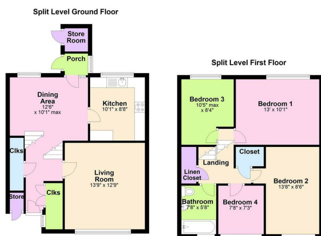
5 Windmill Avenue, Ballynahinch

Terms & Conditions: Please note that these particulars do not constitute an offer or contract of sale. Any prospective purchaser should satisfy themselves by thorough inspection of the property and we recommend that any prospective purchaser should employ the professional services of a building surveyor and consider their findings prior to entering into contract. All such fees associated with this work will be the responsibility of the prospective purchaser regardless of whether the sale completes or not. In addition, none of the appliances or installations have been tested in any way whatsoever and it is our recommendation that a purchaser should fully satisfy themselves by employing an appropriate expert. We would also like to advise that our measurements are taken from the widest points of each room and should not be relied upon as completely accurate. You should not make decisions based on the measurements provided and double check measurements at all times. Valuation/Mortgage Service: As part of our service we would remind Vendors and potential purchasers that we have a Mortgage Broker available at this branch. If you are thinking of selling, we would be happy to carry out a free market appraisal of your property.