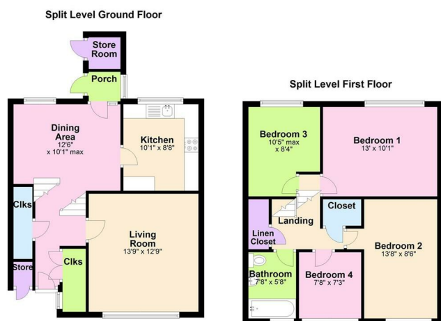
5 Windmill Avenue, Ballynahinch

Terms & Conditions: Please note that these particulars do not constitute an offer or contract of sale. Any prospective purchaser should satisfy themselves by thorough inspection of the property and we recommend that any prospective purchaser should employ the professional services of a building surveyor and consider their findings prior to entering into contract. All such fees associated with this work will be the responsibility of the prospective purchaser regardless of whether the sale completes or not. In addition, none of the appliances or installations have been tested in any way whatsoever and it is our recommendation that a purchaser should fully satisfy themselves by employing an appropriate expert. We would also like to advise that our measurements are taken from the widest points of each room and should not be relied upon as completely accurate. You should not make decisions based on the measurements provided and double check measurements at all times. Valuation/Mortgage Service: As part of our service we would remind Vendors and potential purchasers that we have a Mortgage Broker available at this branch. If you are thinking of selling, we would be happy to carry out a free market appraisal of your property.