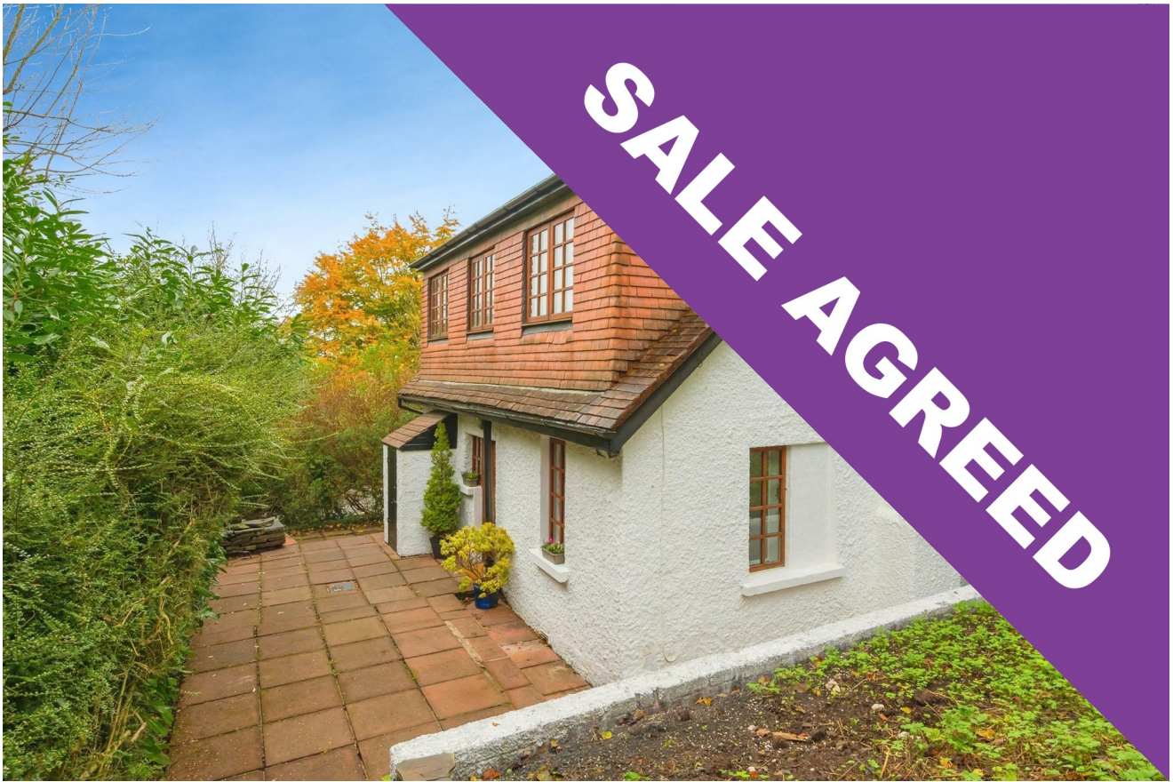
'Hazelwood Cottage', 48 Antrim Road, Newtownabbey, BT36 7PL