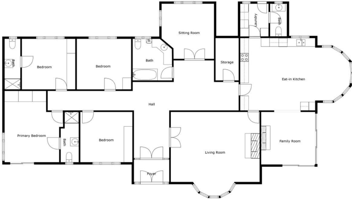
Sizes And Dimensions Are Approximate. Actual May Vary.